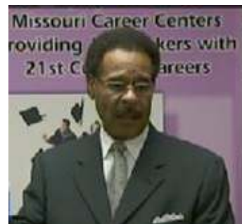
Congressman Cleaver holds a press conference at the Full Employment Council to announce healthcare grant.

The grants included three in St. Louis, Kansas City and Neosho, Mo., totaling $13.2 million. Of that total, $4.99 million was awarded to the Full Employment Council for bi-state job training in the areas of health care and healthcare information technology.